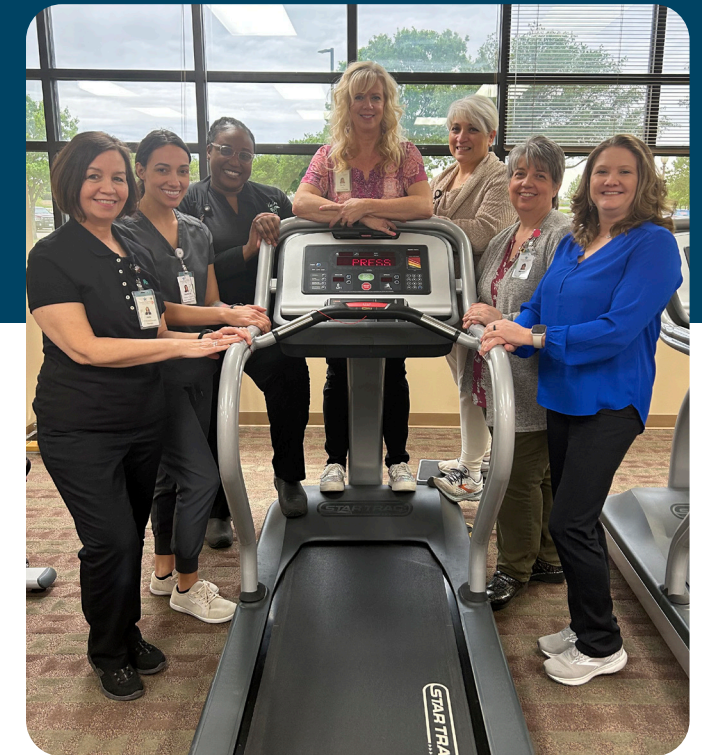
The team of physical and occupational therapists at Ennis Regional Medical Center.

Whether you've torn, broken or replaced it, the Ennis Regional Medical Center rehabilitation team can help you get back to living life to the fullest.